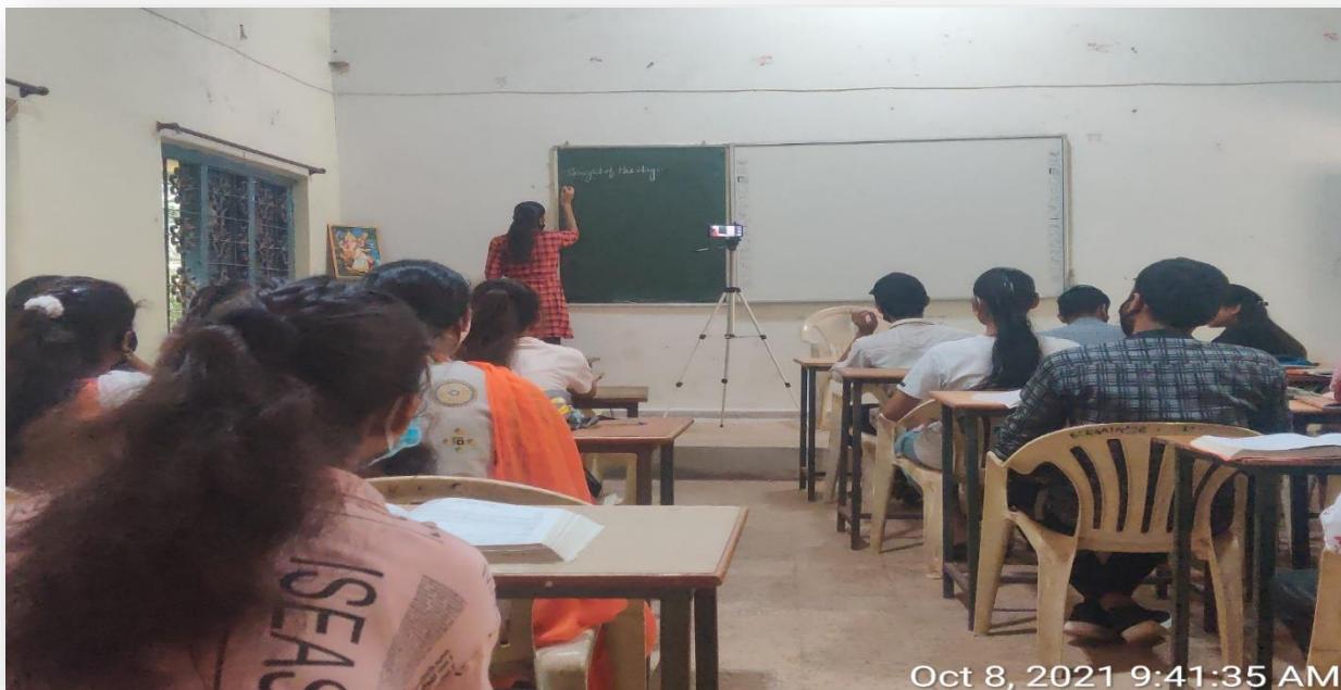
Oct 8, 2021 9:41:35 AM