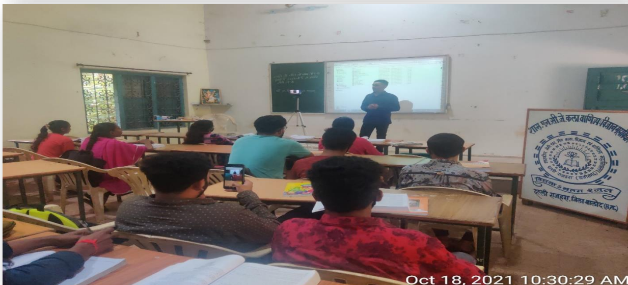
Oct 18, 2021 10:30:29 AM